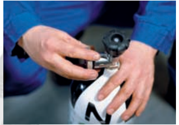
The alphaCLICK adapter fits on all standard threaded cylinders

The alphaCLICK also has a built-in dirt guard, which keeps air clean and ensures smooth functioning.