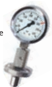
The test gauge provides fast pressure checking

The alphaCLICK test gauge makes checking cylinder pressure in your storage a matter of seconds.